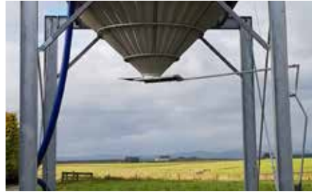
Side Handle Slide Shutter System