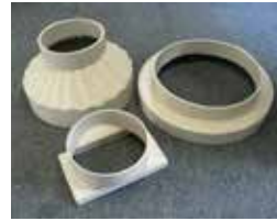
Auger Adaptor Boot