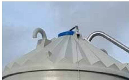
Air Vents & Self-Closing Top Lid