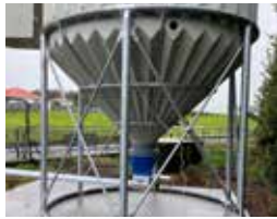
Cert Galv Frame