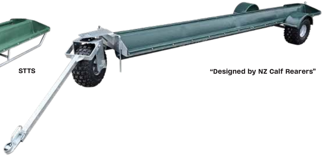
“Designed by NZ Calf Rearers”