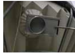
Bag Off Shute