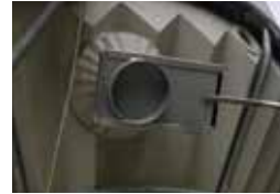
Bag Off Shute