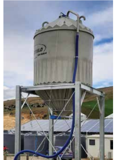
Blower Hose System