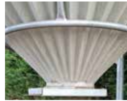
Slide Shutter System