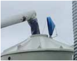
Self-Closing Top Lid