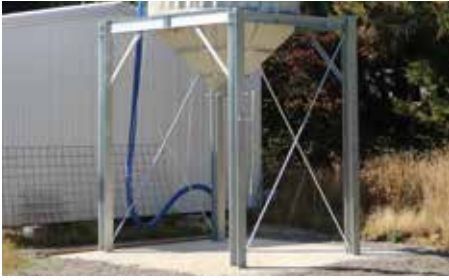
Certified Hot Dipped Galvanised Framing