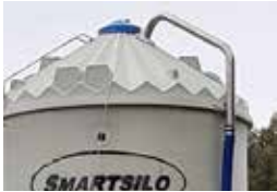
Blower Hose System